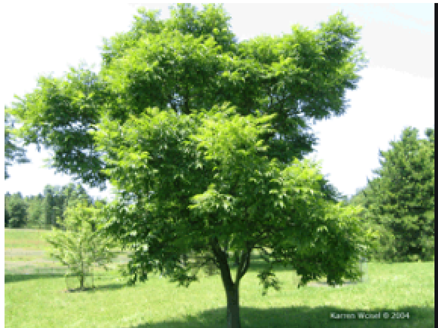
Phellodendron amurense / Amur Corktree *deciduous