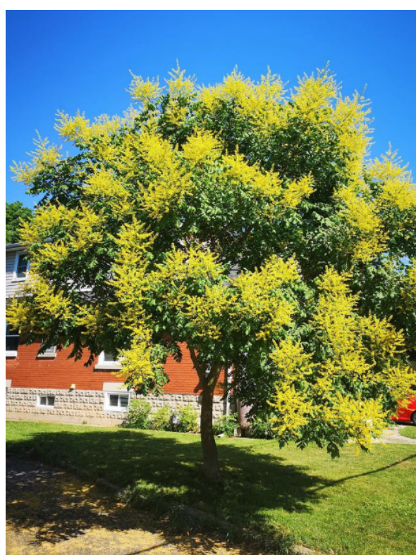
Koeleruteria paniculata / Golden Rain Tree *deciduous