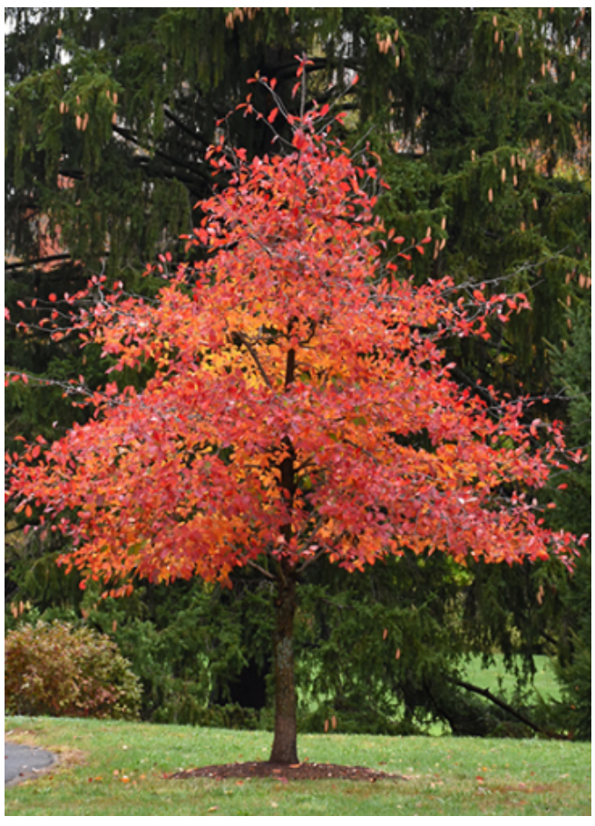
Black Gum (20 trees)