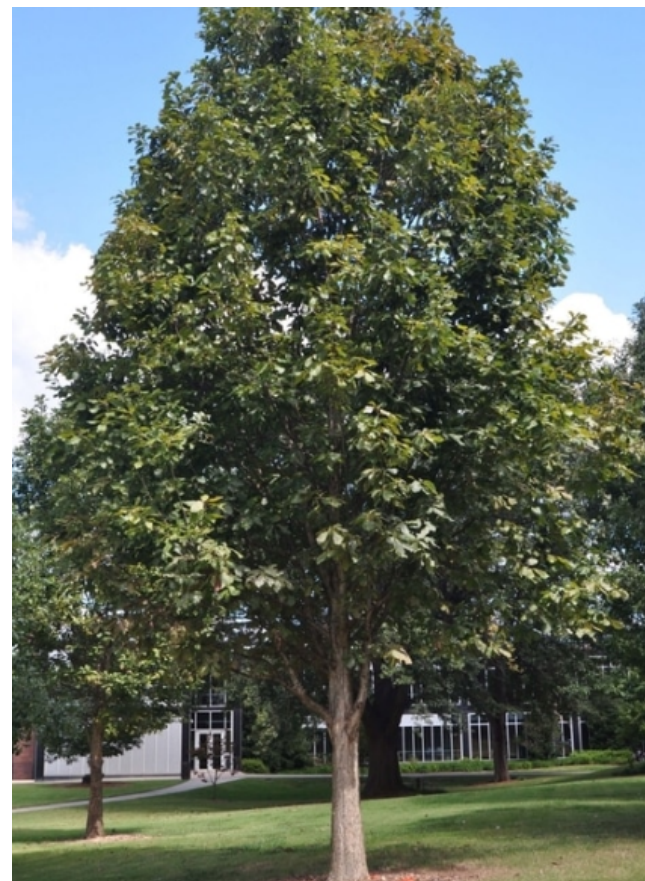
Quercus bicolor / Swamp White Oak