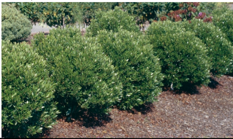
Ilex glabra / Inkberry Holly