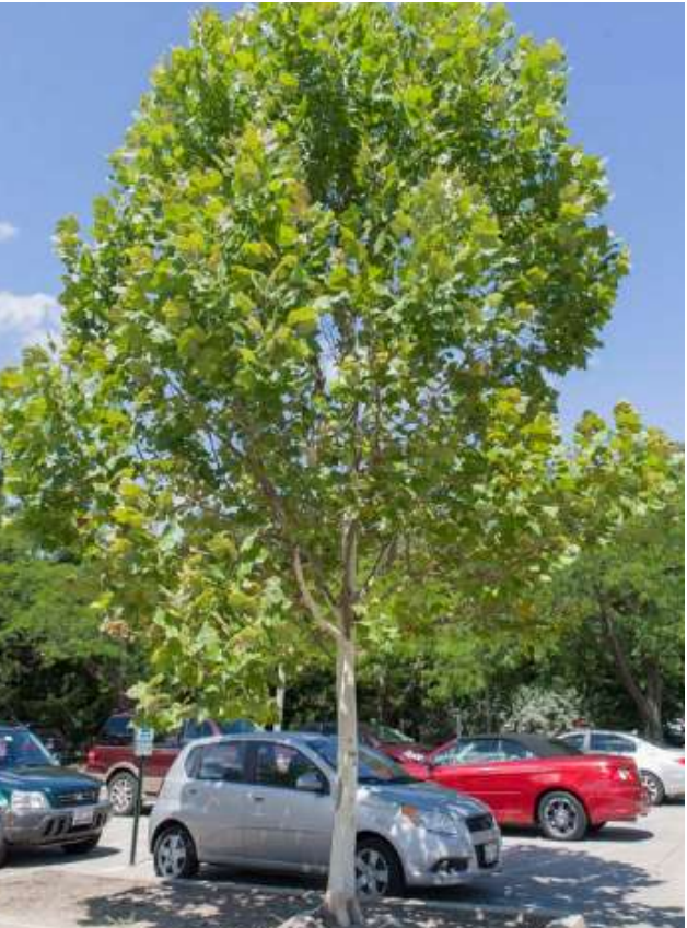
Bloodgood planetree (87 trees)