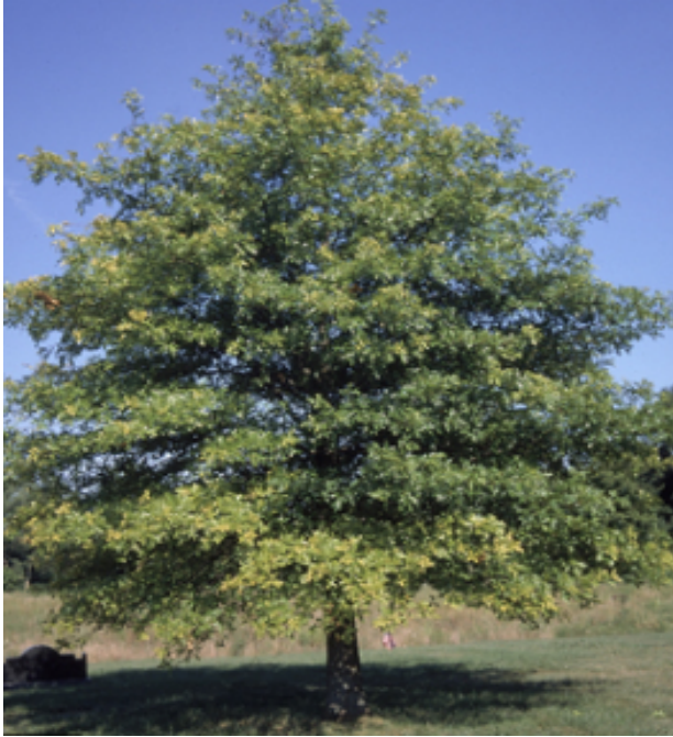
Pin Oak (16 trees)