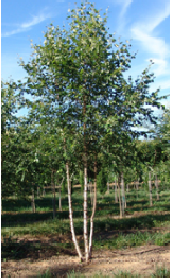
Heritage Birch (21 trees)