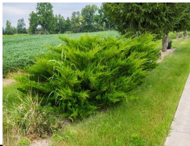
Juniperus chinensis 'Sea Green' / Sea Green Juniper

REFERENCE 1. SURVEY PERFORMED BY MDM, LLC. ON 7/17/19 2. ELEVATIONS SHOWN HEREON ARE BASED UPON GPS OBSERVATIONS TAKEN ON JULY 2, 2019 AND ARE TO THE NORTH AMERICAN VERTICAL DATUM OF 1988 (AVD 88) GEOID12A