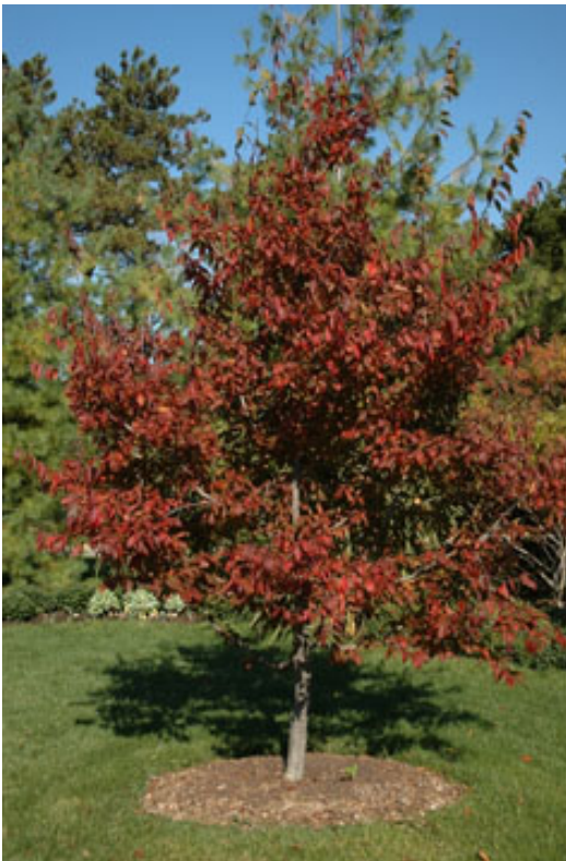
Carpinus caroliniana / American Hornbeam *deciduous