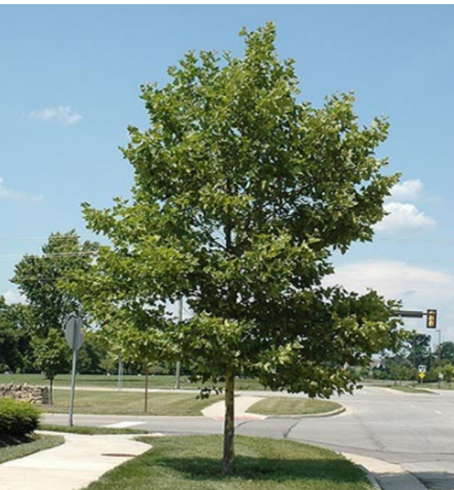
Platanus x acerifolia 'Bloodgood' / London Plane Tree