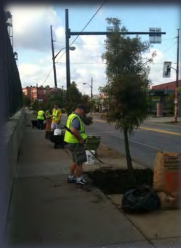
Sep 24, 2011 10:31 AM