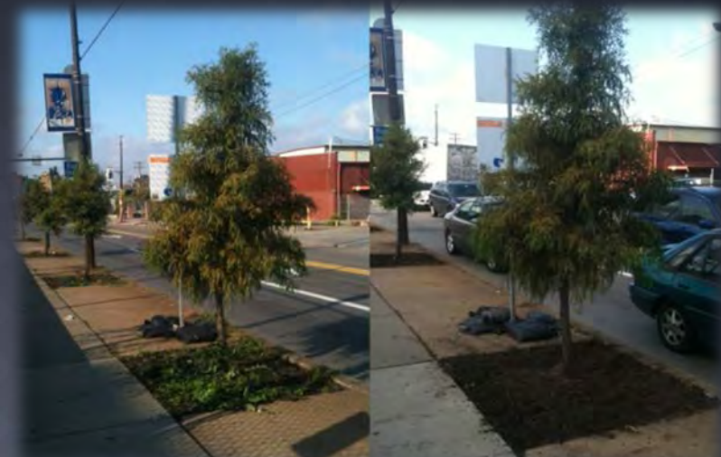
Sep 24, 2011 10:30 AM